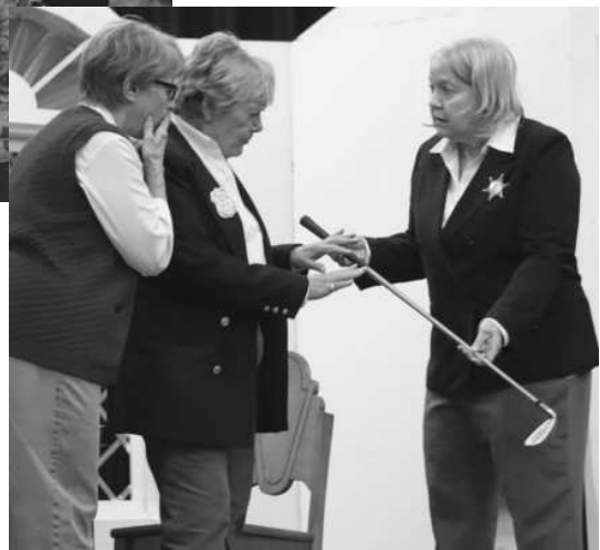
Top two , The Red Velvet Cake War